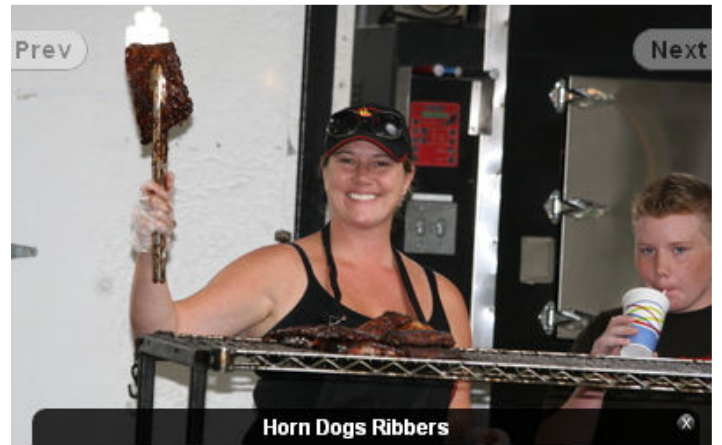
Horn Dogs Ribbers